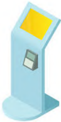
Self service issues and returns