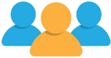
Fewer visitors at one time