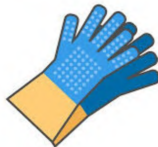
PPE for staff